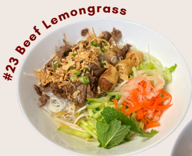
#23 Beef Lemongrass

Chicken, potatoes, onions, lemongrass, coconut milk 13.50