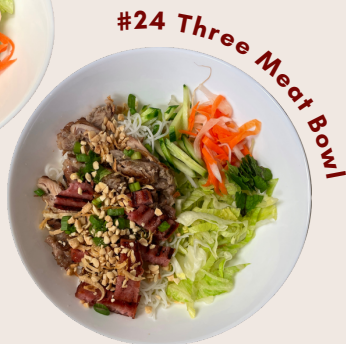
#24 Three Meat Bowl