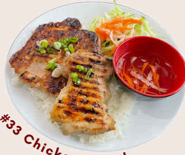
#33 Chicken & Pork

Braised beef, carrot chunks, and a hearty stew 13.50