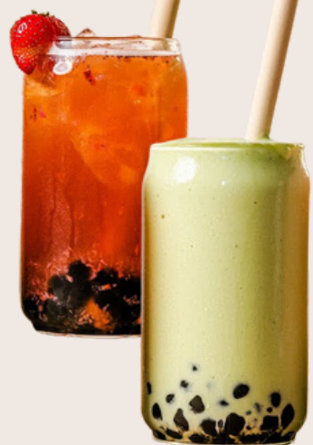
Matcha Slush with Pearls