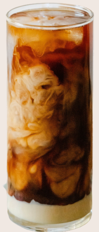
Viet Iced Coffee